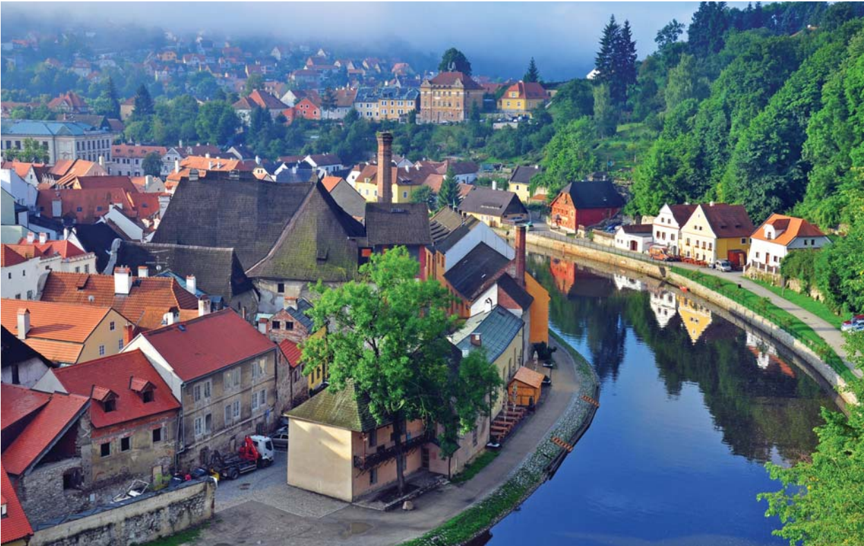
The Historic Centre of Český Krumlov, Czech Republic, is one of many historic cities at risk from catastrophic flooding as a result of more extreme weather events in a changing climate.

and Lin 2014). Tourism in less developed countries offers great potential for economic growth and sustainable development. Since the central concern of World Heritage sites is to preserve their OUV, this should serve as an incentive for communities and nations to properly manage tourism and protect their inheritance, including those assets that are most important as tourist attractions, so as to maintain the appeal for visitors sustainably over the long term. In this way, the growth of the tourism economy and the growth of the number of properties inscribed on the World Heritage List should, in concept, reinforce each other.