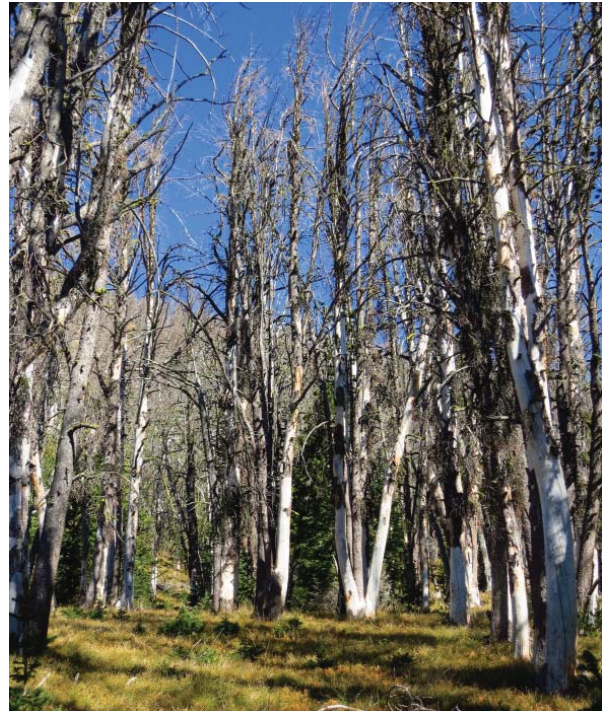
The whitebark pine is under severe threat from beetle infestations driven by a warming climate.

The combination of changed fire regimes, more frequent and severe outbreaks of insect pests and a shift to hotter and drier conditions will eventually change the vegetation of Yellowstone. Different tree species from those of today may dominate