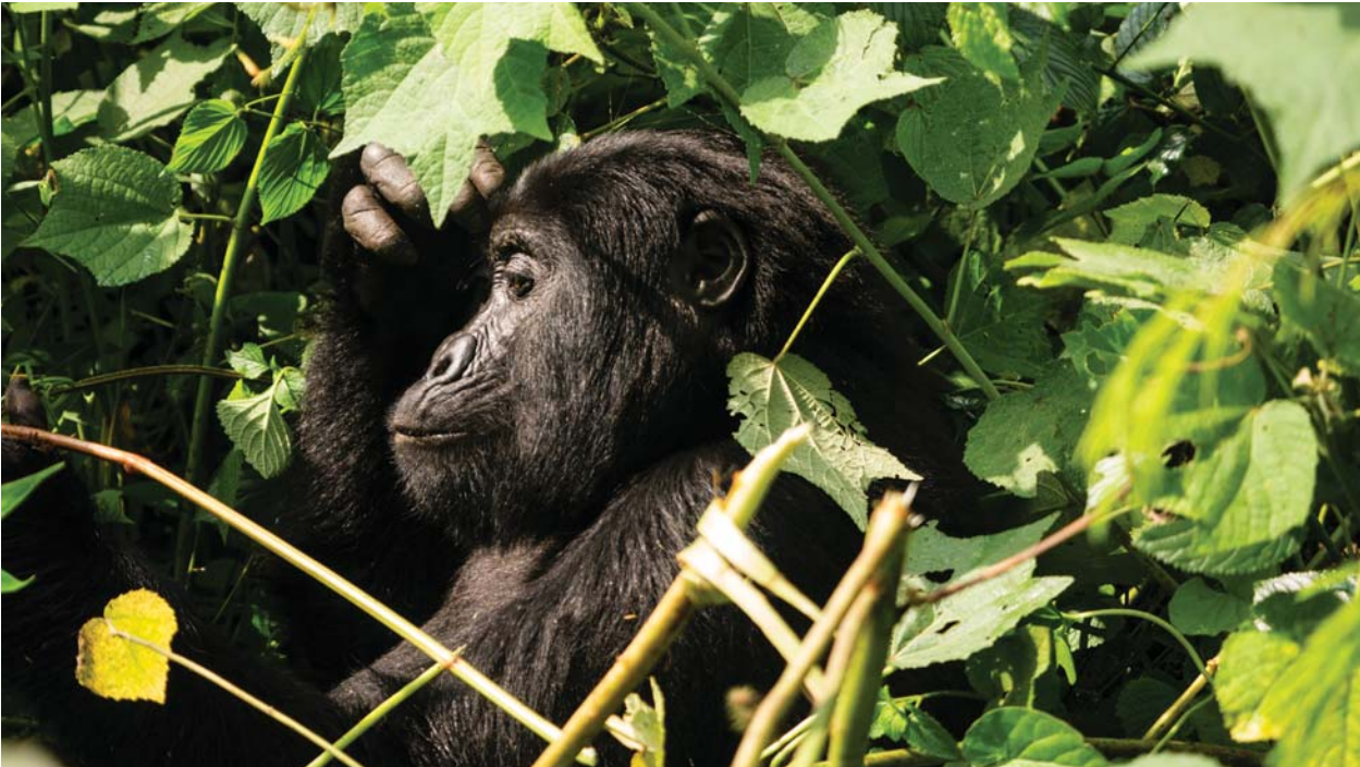
Around half the world's mountain gorillas live in Bwindi Impenetrable Forest National Park.

and this particularly small gorilla group was more susceptible to infection because of stress from being tracked and viewed by tourist groups (Kalema-Zikusoka et al. 2002). If climate change causes increases in poor health amongst human populations around the park, which, for example, has been suggested as likely for a marginalized and poor local Batwa community (Berang-Ford et al. 2012), this could increase the risk of human-to-gorilla transmission of infections. Pioneering efforts, such as those of the NGO Conservation Through Public Health, to increase community health and awareness in local villages and track gorilla health in order to reduce the risk of disease transmission and outbreaks are important, and several have been successfully under way for a number of years.