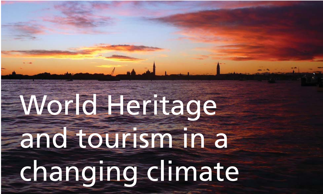
Venice and its Lagoon, Italy