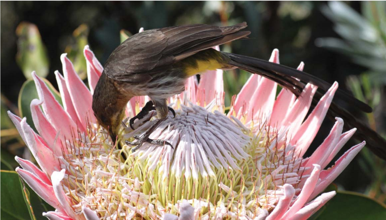
Changes in populations of fynbos pollinating species, such as this Cape sugarbird feeding on a king protea, could have major implications for the ecosystems of the Cape Floral Region Protected Areas of South Africa.

and canoeing; cultural tourism; and visits to historic cities and buildings (UNWTO 2008).