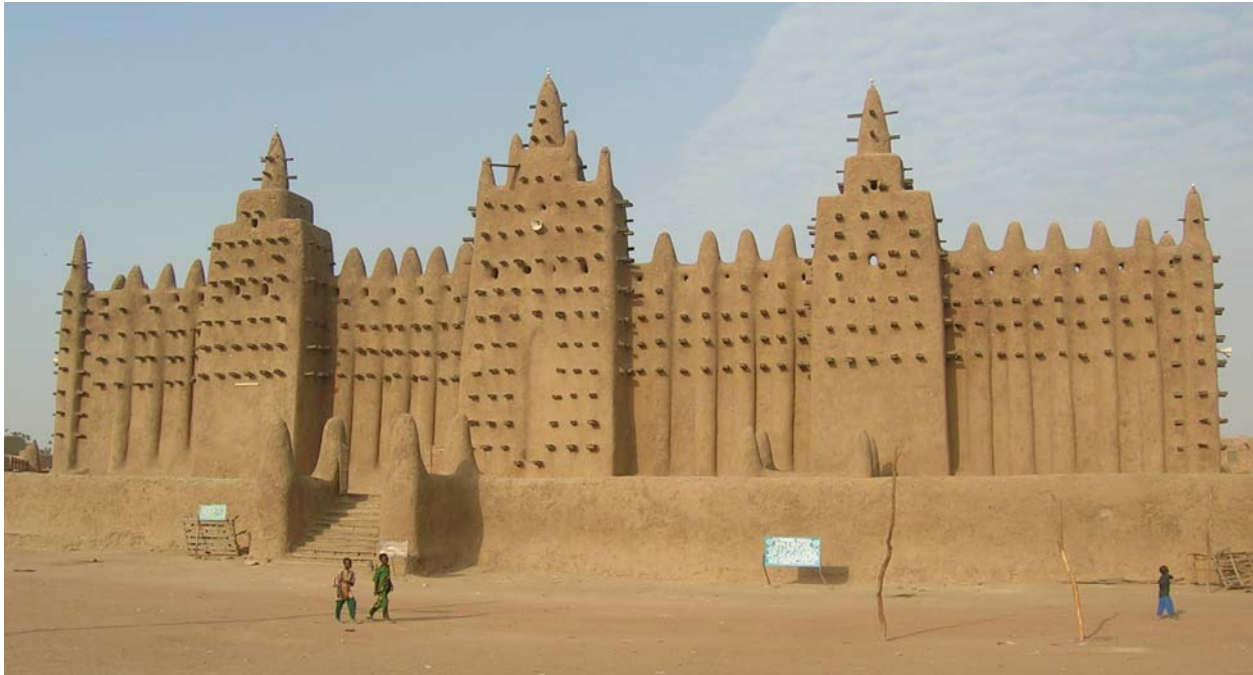
Traditional earthen buildings such as the Djenné mosque in Mali are particularly susceptible to changes in temperature and humidity.

developments, and visitor accommodation and associated infrastructure (UNESCO 2014b).