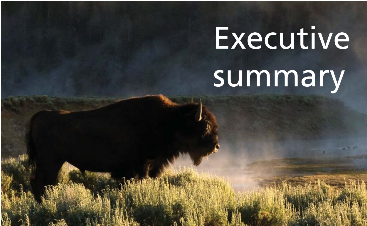
Yellowstone National Park, United States of America