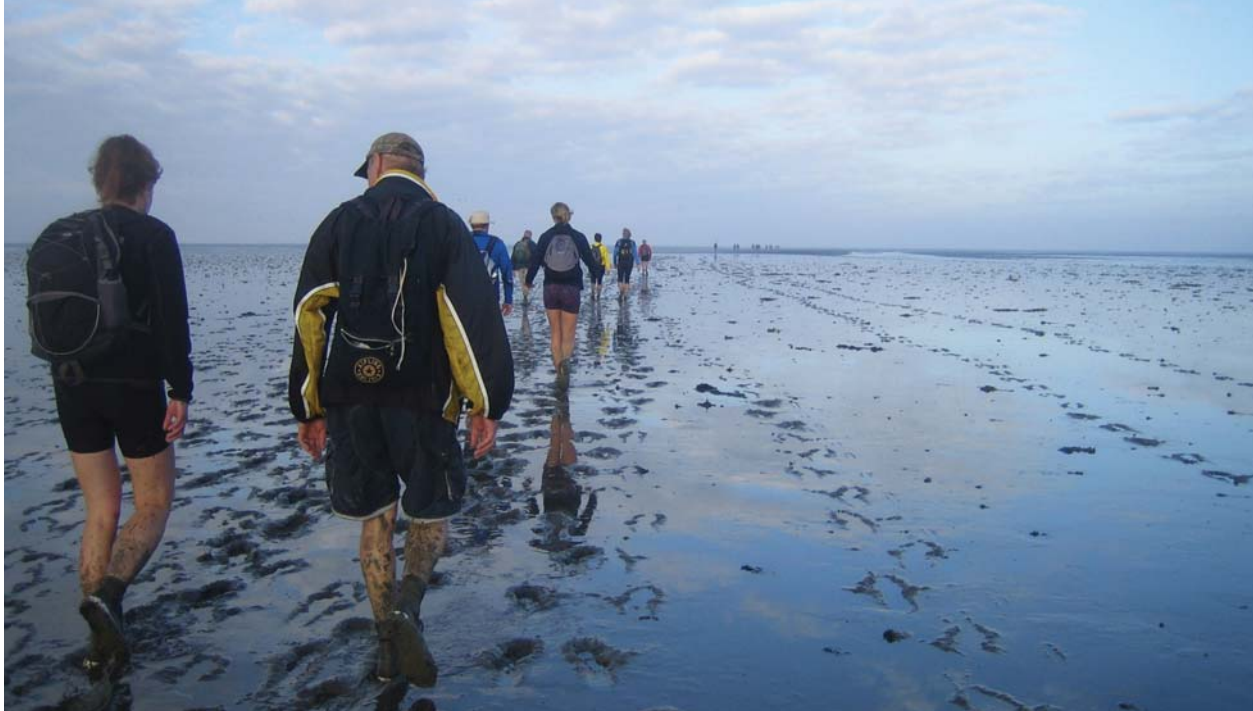
The Wadden Sea attracts about 10 million visitors a year.

may cause a loss of intertidal flats and salt marshes, leading to a decline in foraging and nesting possibilities for migratory and breeding birds (MELUR-SH 2015; Bairlein and Exo 2007; Brinkman et al. 2001). As a result of temperature rise, the plankton at the base of the food web may change, which could lead to changes higher up in the food web, including lower reproduction levels of fish populations and decreasing bird populations (NEAA 2014). In an ecosystem as complex as the Wadden Sea, the effects of climate change may also result in a cascade of yet unknown but wide-ranging changes.