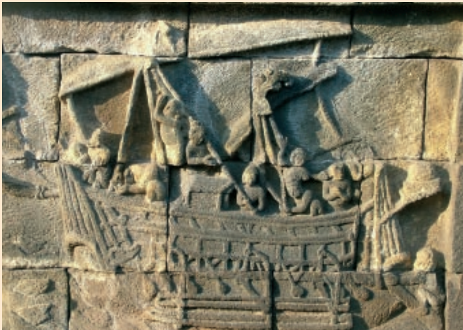
Ancient seafaring – fresco on the walls of the temple of Borobudur, Indonesia.

In recent years, underwater cultural heritage has attracted increasing attention from both the scientific community and the general public. To scientists, it represents an invaluable source of information on ancient civilizations and historic seafaring. To the public at large, it offers an opportunity to further develop leisure diving and tourism.