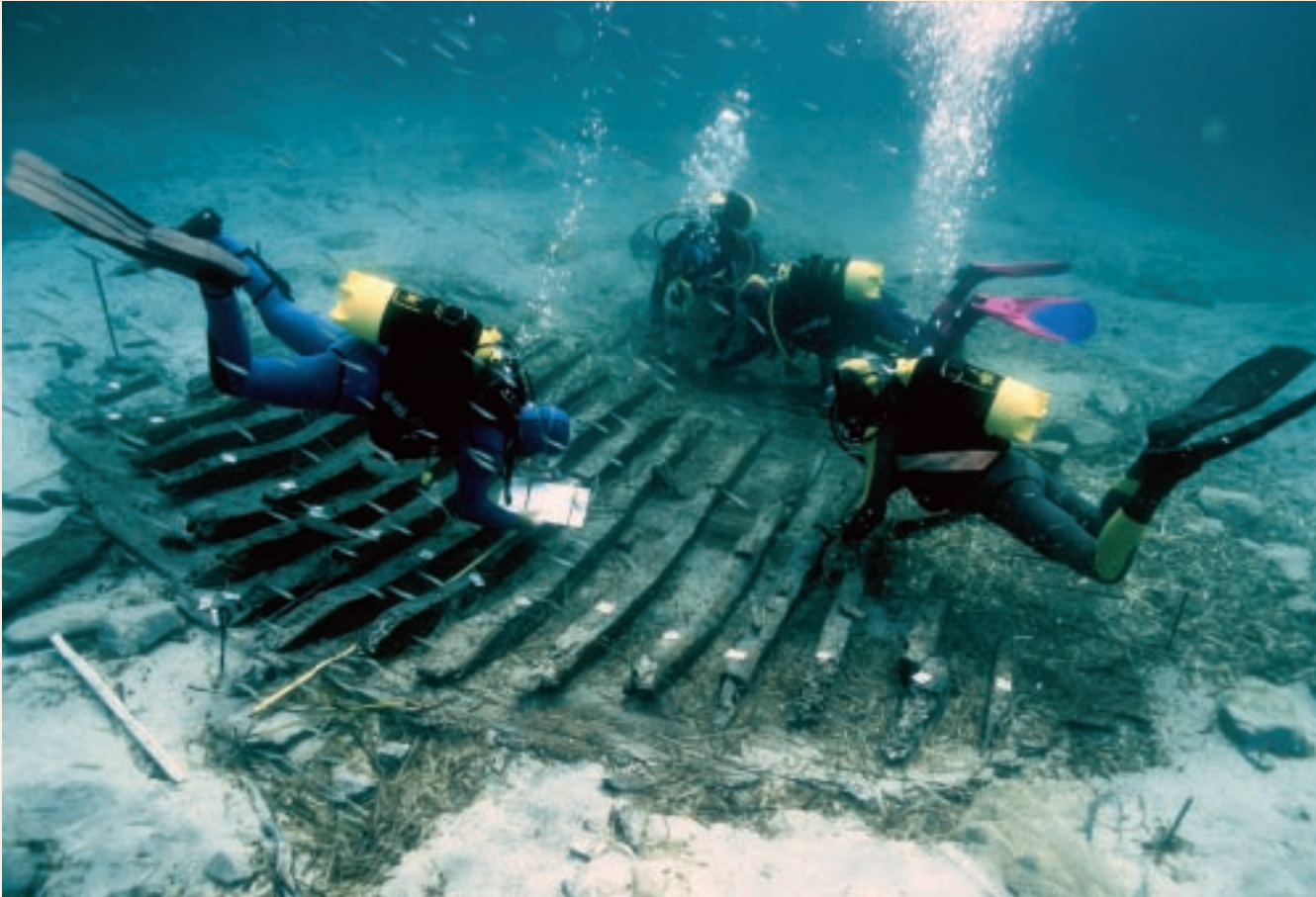
Italy, wreck located in Baia Salinedda, III. Century A.D.