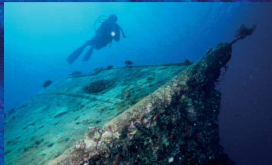
E. Trainito © UNESCO. Wreck of the Umbria , Wingate Reef, Port Sudan.

The 2001 Convention regulates that it has to be applied in conformity with other international law, including UNCLOS.