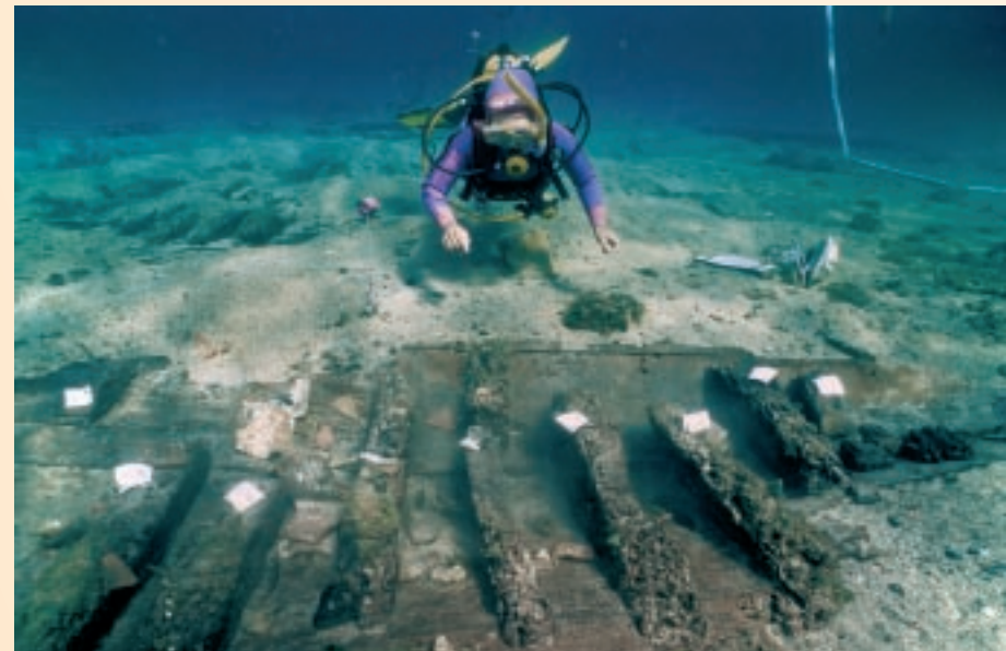
Italy, wreck located in Porto San Paolo, III. Century A.D.

Information shared between States Parties or UNESCO shall be kept confidential and reserved to the competent authorities as long as the disclosure of such information might endanger the preservation of underwater cultural heritage.