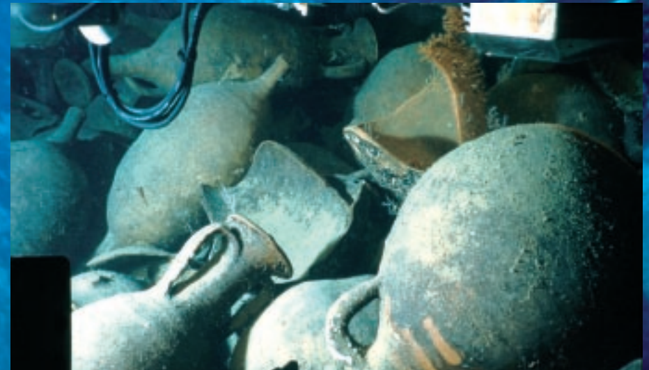
France, Amphorae at great depth, Arles 4, 1 st century A.D.

How can you call this planet earth, when it is quite clearly water?