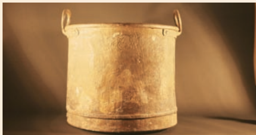
France, Copper cauldron, wreck of the Dorothee , 1693, Villefranche-sur-Mer, excavation by M. L'Hour.

• The Pharos of Alexandria and the palace of Cleopatra , in Egypt, were driven into the sea by a series of earthquakes in the fourteenth century. Today, they lie 6 to 8 metres under the waters of the bay of Alexandria. Underwater archaeologists and other scientists have carried out several excavations to explore and save the ruins. Thousands of objects (statues, sphinxes, columns and blocks) superimposed from Pharaonic, Ptolemaic and Roman periods have been recovered and partly presented to the public in major exhibitions, each drawing thousands of visitors. The rest of the ruins will be left in the bay, and the construction of an underwater museum in cooperation with UNESCO is being considered in order to preserve the relics in situ .