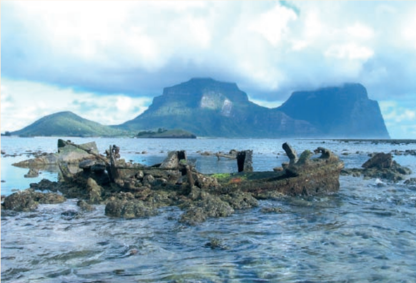
Wreck of Jacque del Mar , touching the water surface.