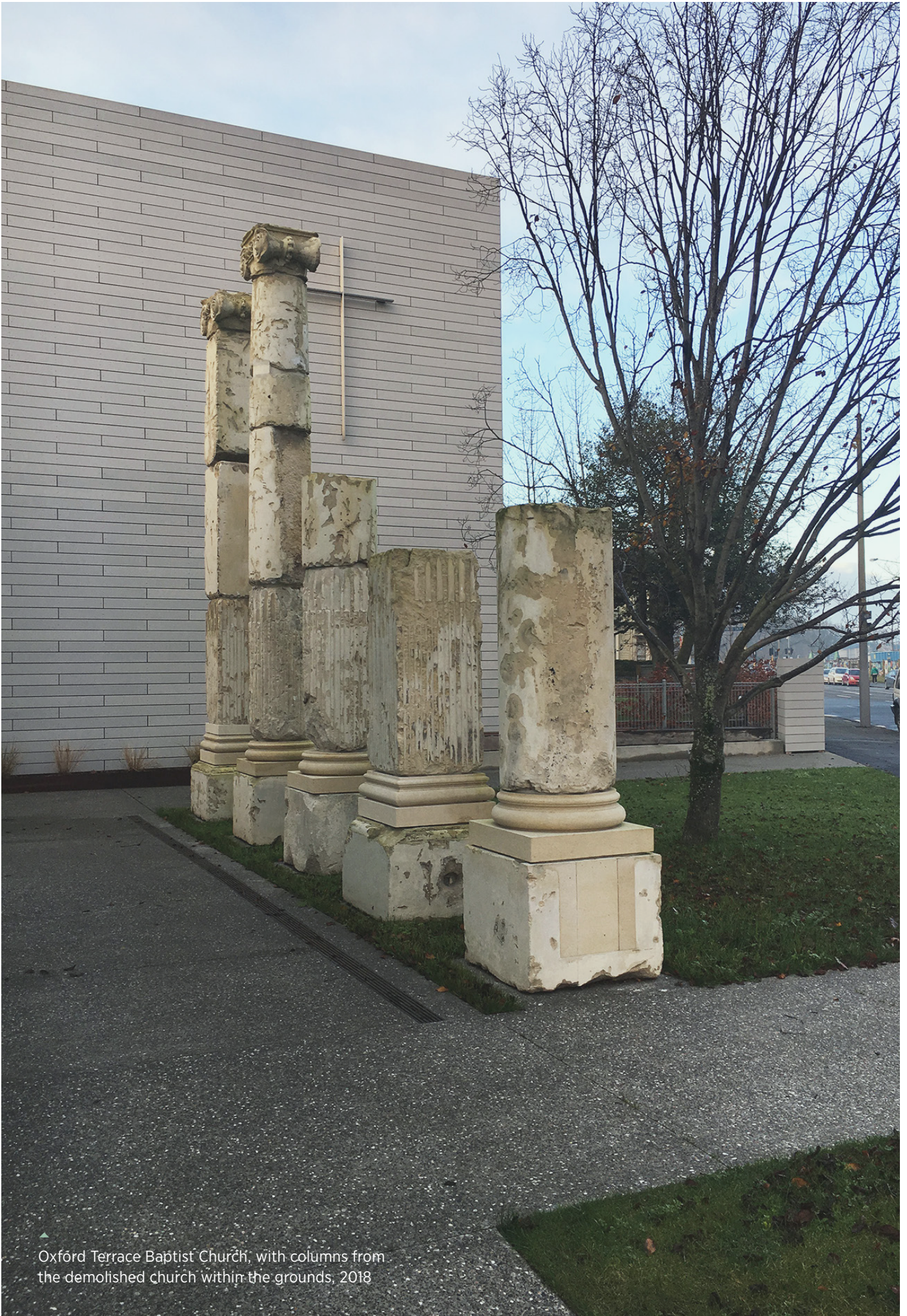
Oxford Terrace Baptist Church, with columns from the demolished church within the grounds, 2018